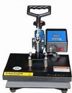
Fancierstudio power heat press manual. Fancierstudio heat press 9x12 manual.